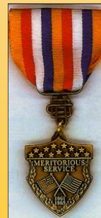
Meritorious Service Award