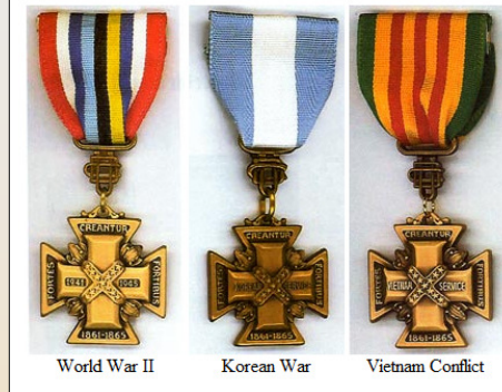
World War II Korean War Vietnam Conflict