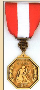
National Defense Service Medal